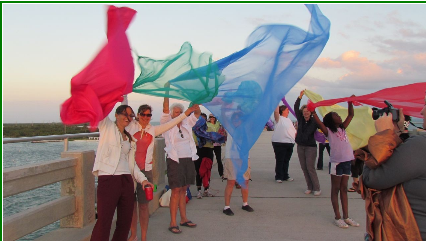
The Full Moon Daughters scarf dance at sunset on the old railroad bridge at Bahia Honda State Park, in the Florida Keys.

W ant to make a big impression on everyone else in the campground? Try scarf dancing on a bridge in the beautiful Florida Keys at sunset. The Full Moon Daughters did exactly that during this year's camping trip to Bahia Honda State Park on November 11-13, extending a sunset tradition started last year. We had a record Bahia Honda attendance of 24 women and girls, who slept under the stars (well, a couple stayed in hotels) in one of Florida's most lovely parks.