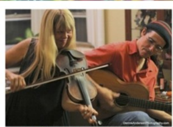
Still on the Hill Ozarks "Folkgrass" Saturday, March 22nd