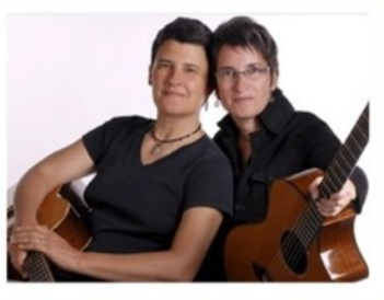
Emma's Revolution Truth, Hope, Irreverence Friday, Dec. 6th

(Five Regular Season Concerts - excluding the Special October Event)