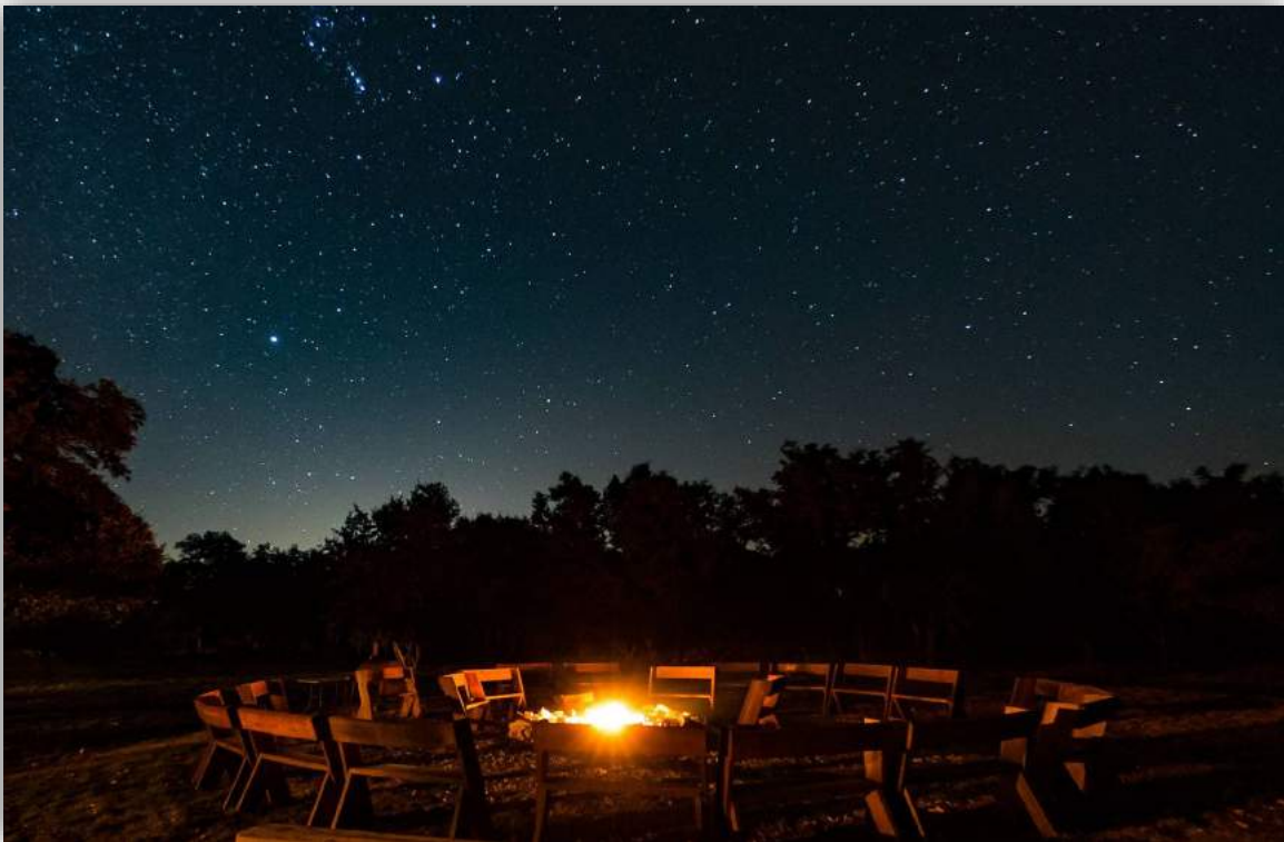
Dark sky photo by John Phelps

http://ubaru.org/home/AstronomyWeekend for detailed pricing of the various options.