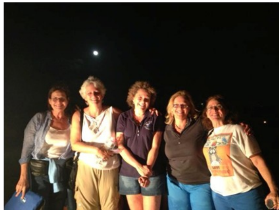
(Pictured Here) In April, the Full Moon Daughters participated in a Full Moon Kayaking trip at Oleta River State Park in North Miami Beach.

See you on the water, along the trail and under the stars!