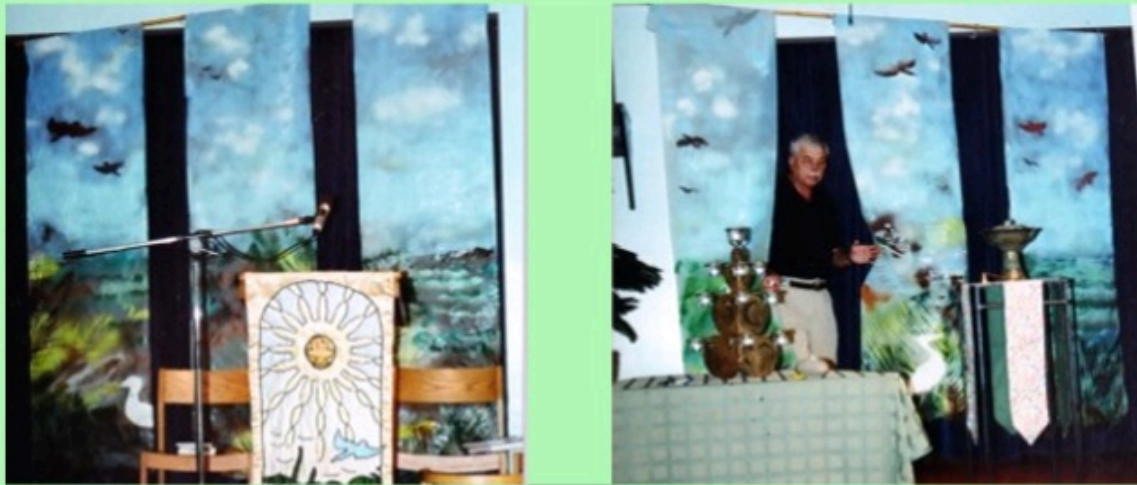
Spiritual Art's Central Park Elementary School Banners 2004

Come Help. As we create together in the company of others on this path of human spirituality in our River of Grass community.